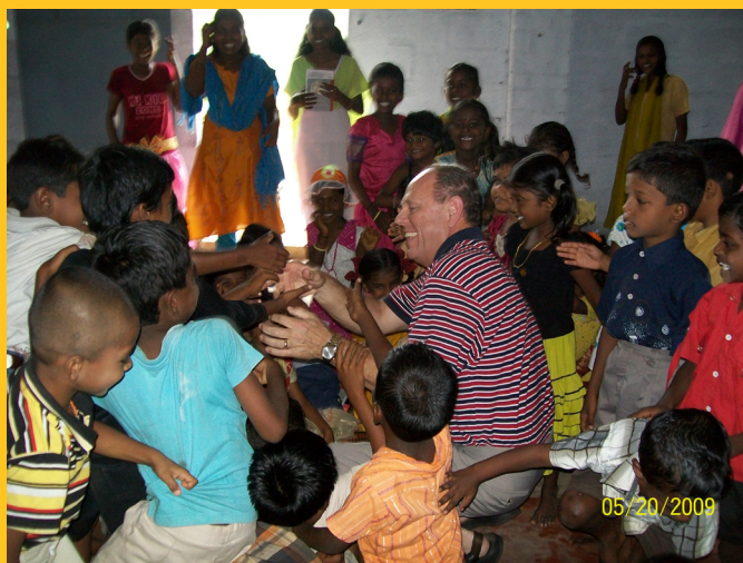
The faces tell it all. Thank you for helping to reach India with Christ. . .one child at a time.